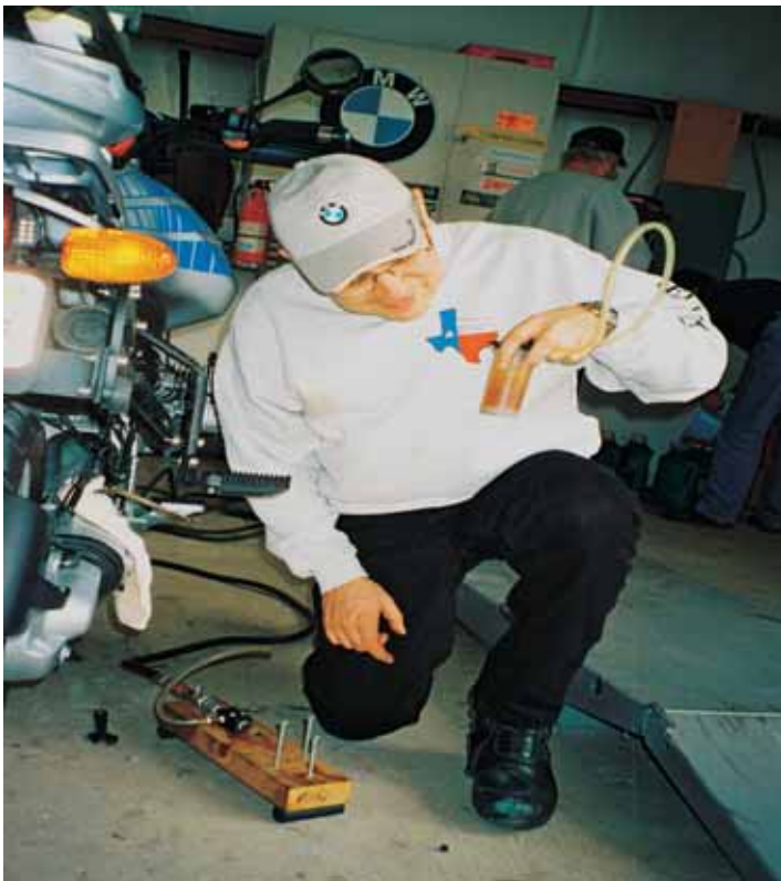
This brake fluid needed changing