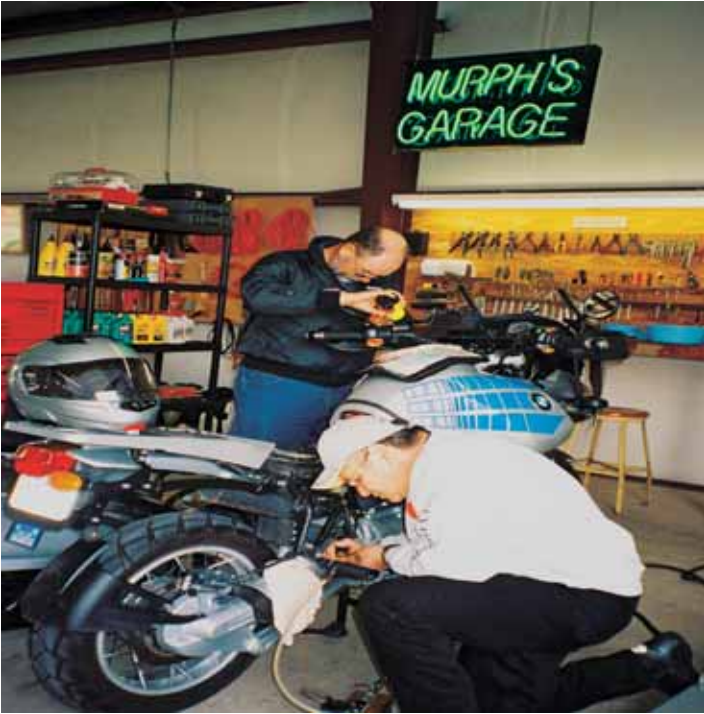
The action took place at Murph's Garage.